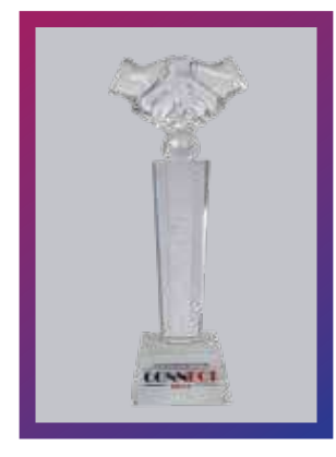
2014 Innovation in women security

2019 Skoch order of merit, Top 200 SMES in India