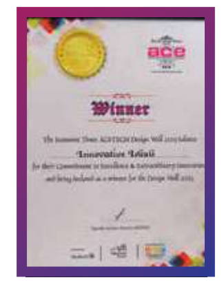
2013 GOLD Winner @ Design Wall of FameAwarded for contribution in Surveillance

2018 Skoch order of merit, Top 100 SMES in India